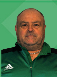
Available To Sponsor