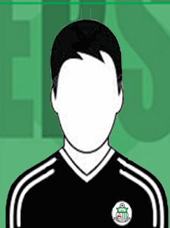
Available To Sponsor