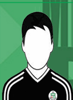
Available To Sponsor