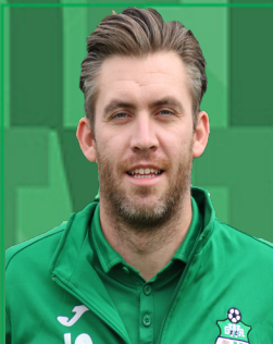
Sponsored by Roy Ketteridge