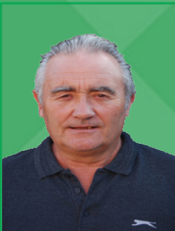
Sponsored by Belton Bros Ltd