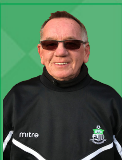
Sponsored By David Patient